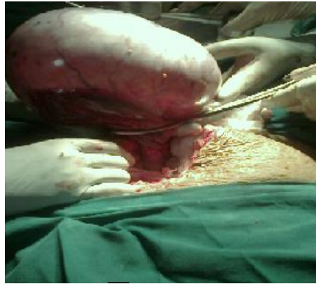
Fig 3 Gross intra operative appearance of the ovarian tumour